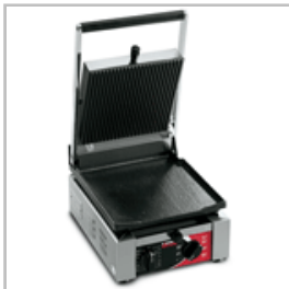
ELIO L Timer